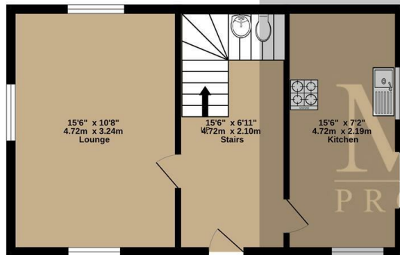
GROUND FLOOR 383 sq.ft. (35.6 sq.m.) approx.